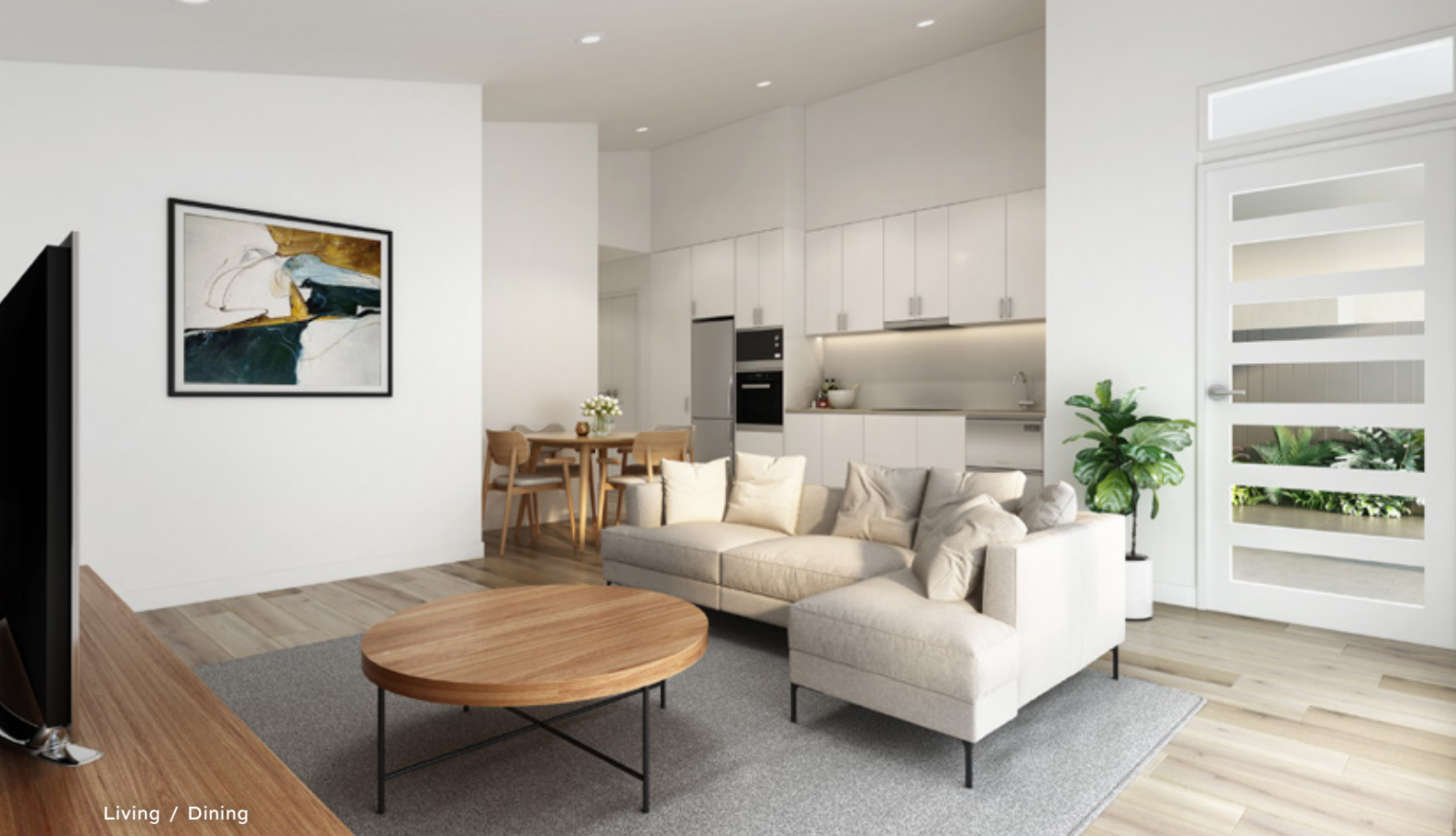
Living / Dining